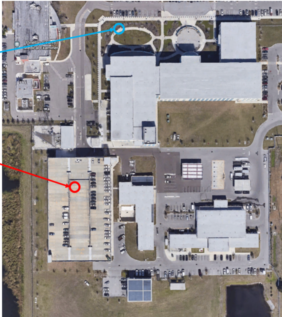
Pinellas County Public Safety Complex